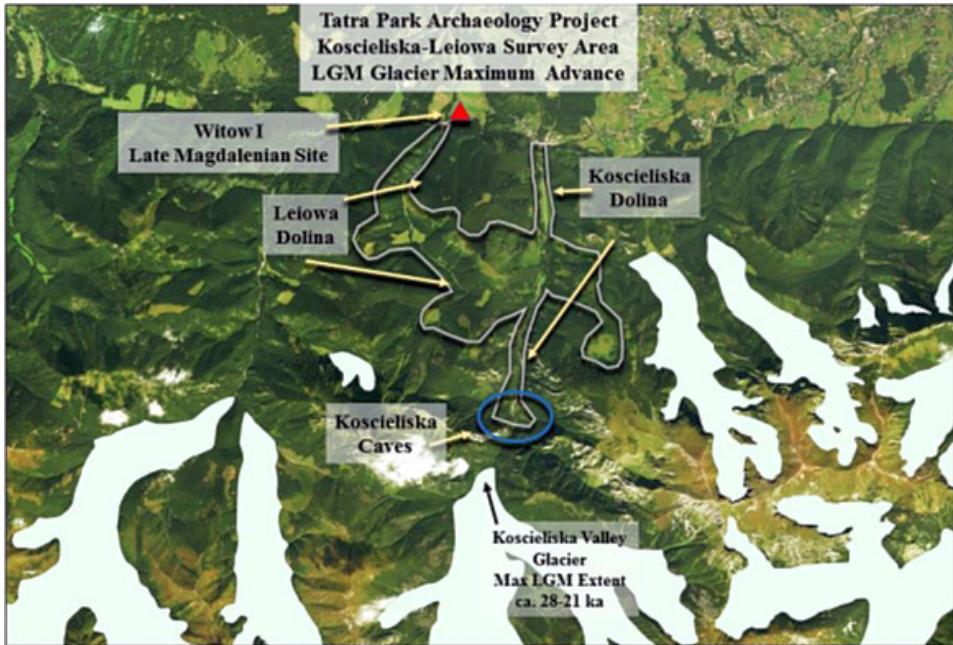
Fig. 2. GIS map of modeled Late Glacial Maximum Tatra Park valley glacier positions.

Projected in ArcGIS™ 10.3 using from on-line GIS (source data layers from Zasadni, Kłapyta 2014)