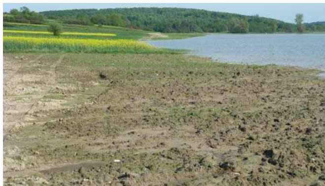
Photo 2. Lack of buffer zone between the shore of the reservoir and arable fields (2013)

Research conducted in 2009–2011 showed that groundwater was characterized mostly by poor quality. Indicators that lowered the water quality were mostly nitrogen compounds contributing to the eutrophication of surface waters. Maximum concentrations of ammonium ions, nitrates and nitrites amounted to: 5.26 \text{ mg} \cdot \text{dm}^{-3} (July 2009), 188 \text{ mg} \cdot \text{dm}^{-3} (April 2010), and 2.24 \text{ mg} \cdot \text{dm}^{-3} (July 2009), respectively (Tab. 1). The high phosphate content in groundwater was recorded only in 2009, as indicated by 4.5–10 times higher average value of this indicator as compared to average values in 2010 and 2011 (Tab. 1). Also ele-