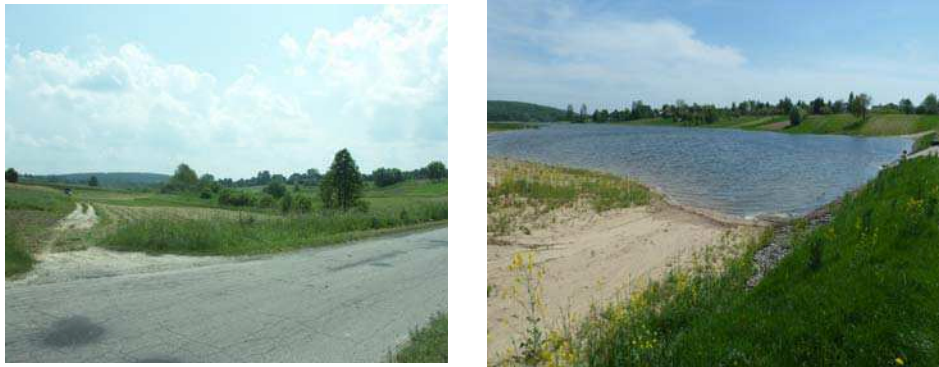
Photo 1. View of the valley of the Milutka stream before construction of the reservoir and after its completed (2009, 2013)

its whole surroundings are arable fields or pastures (directly bordering with its shore), and only on the east there are grasslands. Ploughing fields to the very shore of the reservoir took place in a few cases (Photo 2). Such a method of cultivation and location of the arable fields on slopes favours rapid runoff of contaminated rain and snowmelt waters into the reservoir.