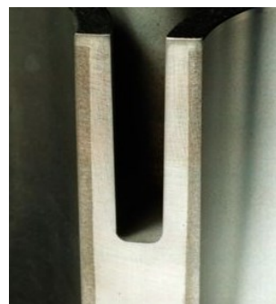
Fig. 2. An example casting with a cast-in component

the cylinder bearing surface must be in this case shaped as a cast-in element by means of etching methods. An example of casting provided with a cast-in component is shown in Fig. 2.